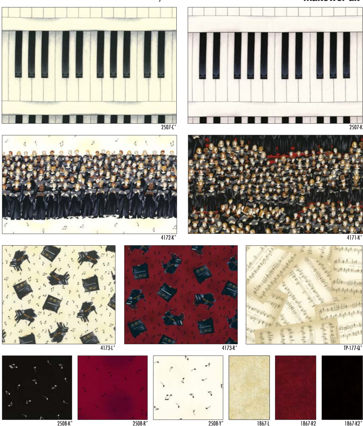
Free Pattern Download Available at www.andoverfabrics.com